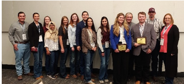
Department of Animal and Range Sciences faculty and staff in attendance at the American Society of Animal Science Annual Meeting in Oklahoma City, Oklahoma