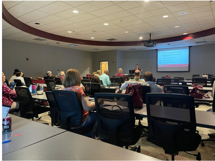
Dean's Retreat on 07/25/2022

In the last week of July, we had the ACES College Leadership Retreat. In this retreat there was the opportunity to listen to advances and goals of the college to move forward and learn about progress in academics, research and extension. An update from the dean is that leadership will be involved in various activities.