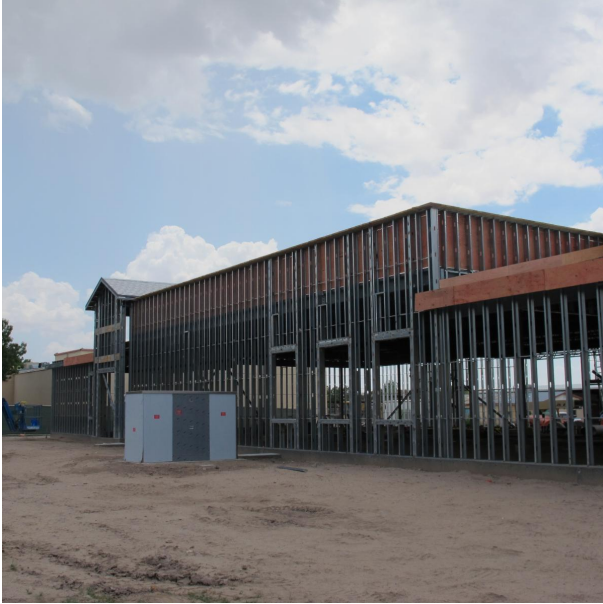
Biomedical Research Center