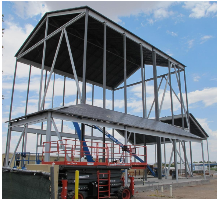
Animal Nutrition and Feed Manufacturing Facility

To view a live progress of the construction click on the link below: NMSU: ACES | About – WebCam