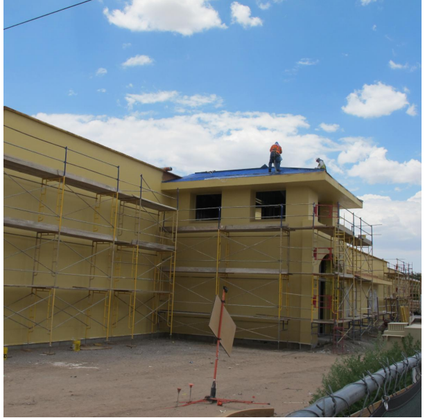
Food Science, Security, and Safety Facility