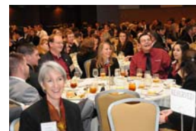
NMSU/NAMA at the 2009 NAMA conference and marketing competition held in Atlanta, GA.