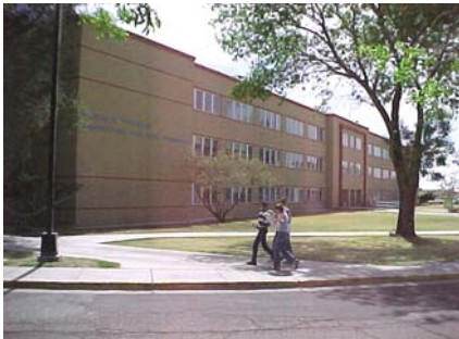
GERALD THOMAS HALL CORNER OF COLLEGE AND KNOX

DEPARTMENT OF AGRICULTURAL ECONOMICS AND AGRICULTURAL BUSINESS MSC 3169, PO BOX 30003 LAS CRUCES, NM 88003-8003