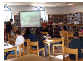
Classroom instruction for Zuni high school students as part of the "Reviving Traditional Zuni Agriculture and Production Practices" project.