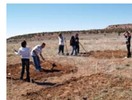
Zuni high school students begin field preparation for the "Reviving Traditional Zuni Agriculture and Production Practices" project.