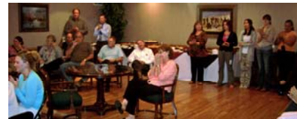
Graduate students, staff, and faculty.