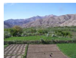
Afghan landscape with farms.