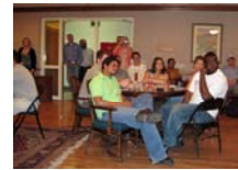
The graduate students were in attendance.