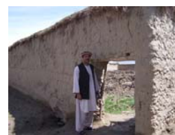
Wall around and entrance gate to a small farm.