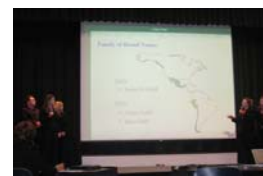
NMSU/NAMA Team 2 at the Western Collegiate Food Marketing Competition presenting their project on Santa Fe Gold: Sweet Onions