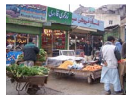
Vegetable market in Kabul.