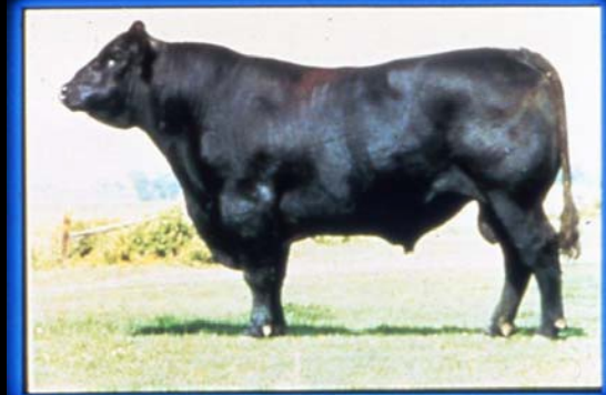
ANGUS (29AN1366 OSCAR)