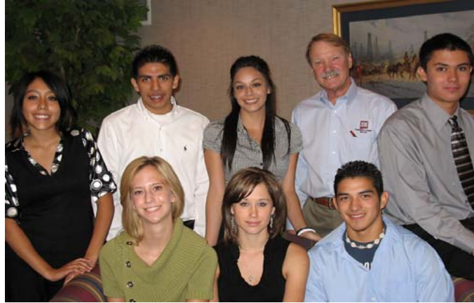
NMSU's first YES Camp Graduates Class of 2008

YES Camp is a shining example of active university and community collaboration providing high school students with expanded educational opportunities and access to higher education, while at the same time strengthening the community's future.