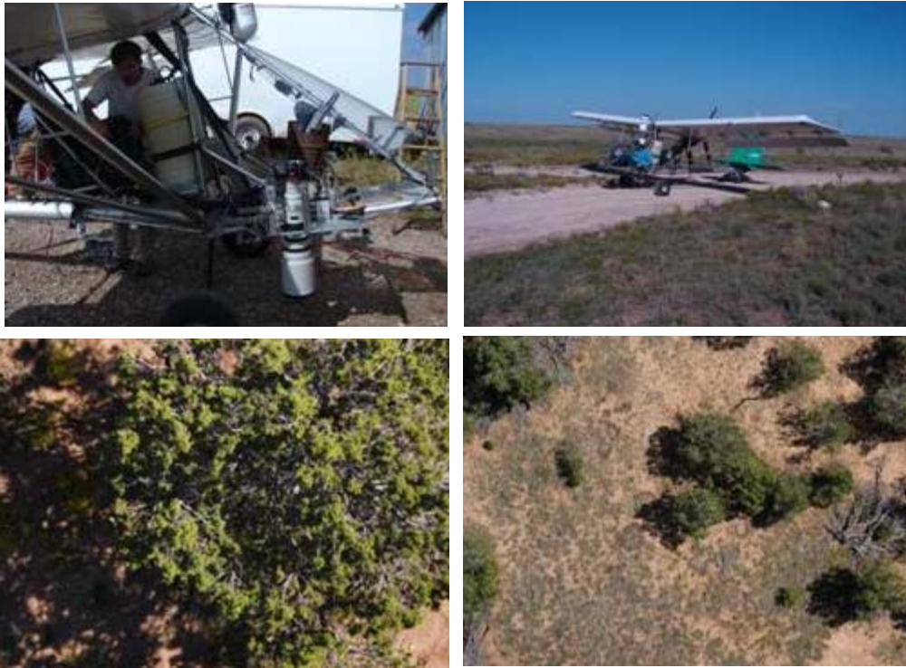
Figure 2: Lightweight aircraft used (upper left and right) and example of paired 7.2 mm (lower right) and 1.1 mm (lower left) digital images taken at one sampling point with fields of view of 36 x 24m and 3 x 4m, respectively.