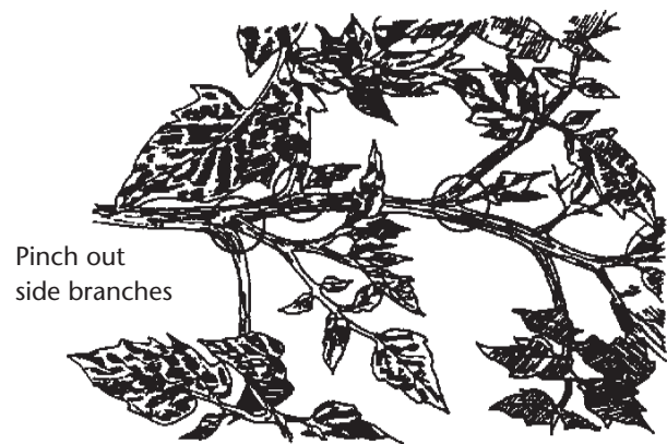
Figure 2. Pinch out branches in axils.

If tomatoes dry out, or if they are watered unevenly, many diseases may appear. Blossom-end rot is a physiological disease that appears as a leathery, sunken scar on the blossom end of the fruit. Mulching often helps reduce the disease by keeping a more even water supply available to the plants.