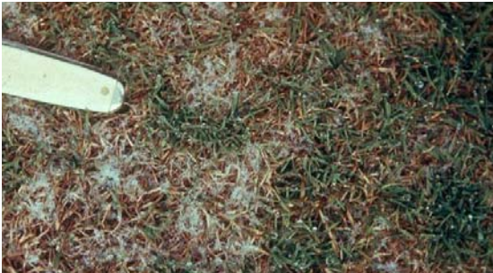
Mycelium of Rhizoctonia solani on infected grass.