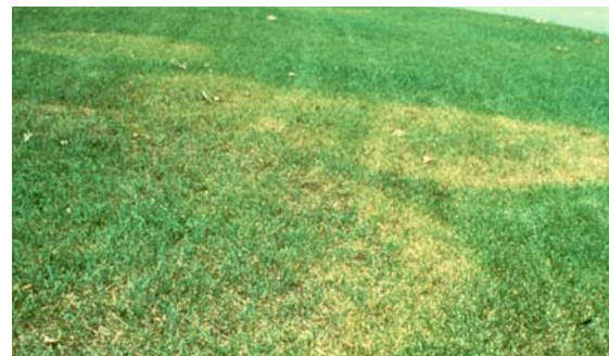
Brown patch on fescue.