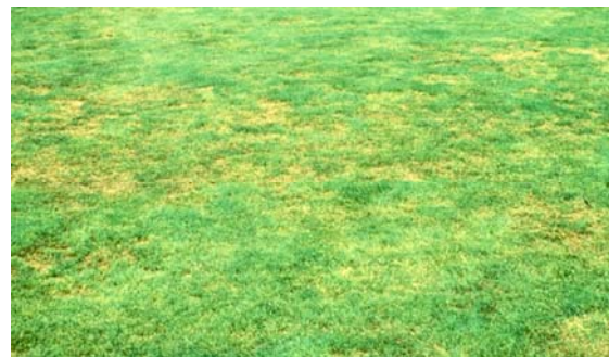
Diffuse damage caused by brown patch.