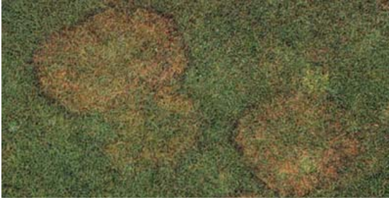
Smoke-rings caused by Rhizoctonia solani.