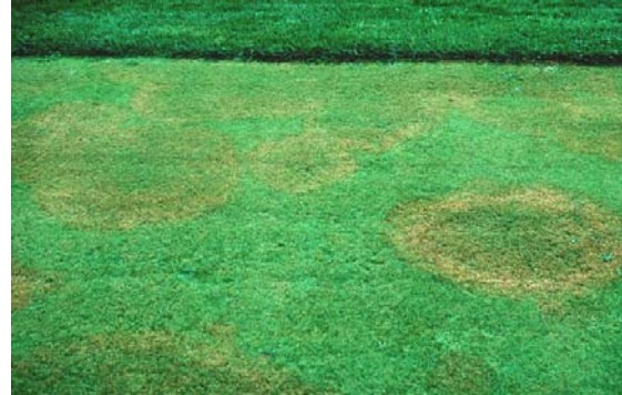
Brown patch on a bentgrass putting green.

Symptoms: Although the symptoms are highly variable, depending on turf species, mowing height, soil and environmental conditions, the disease is generally characterized by small to large circles or irregularly shaped patches of brown, dead and dying grass. Centers of the spots may recover, resulting in rings of diseased grass. In some cases, no patches or circles are apparent and the disease appears as a diffuse yellow blight. The disease may produce blighted patches with a purplish – gray border (“smoke-rings”) on closely mowed, cool-season grasses. Leaves of individual plants may have small to large, irregularly shaped, tan lesions with a noticeable dark brown margin. Infected leaves become chlorotic to olive-green in color and wilt, eventually turning brown as they die. When dew is present on the grass, white, cobwebby mycelium of the fungus can sometimes be seen on the surface of affected grass plants. Stems, crowns, and roots also may be infected. In light attacks, roots and crowns usually are not involved, and plants recover. Dark brown resting structures (sclerotia) composed of hard masses of fungal mycelium may develop at the base of infected plants.