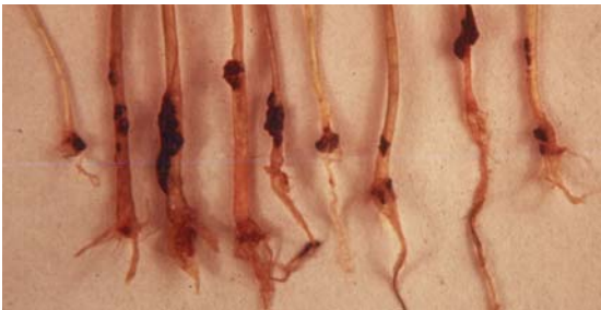
Sclerotia of Rhizoctonia solani on the base of turfgrass plants.

Conditions for Disease: The fungus survives in soil, in infected plants and plant debris as mycelium and sclerotia. It is spread by leaf to leaf contact and by movement of infected plant material by equipment, people, animals, water and wind.