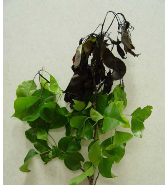
Fire blight on pear (note shepherd's crook).

Symptoms: Fire blight can infect blossoms, fruit, stems, leaves, and woody branches. The characteristic symptom of fire blight is that affected plant parts (most notably the branch terminals) suddenly wilt, turn black and appear to have been scorched by fire. The afflicted plant parts die but usually cling to the plant. Young, vegetative shoots are shrunken and brown to black, and the tips often curl downward at approximately 180° angles to resemble shepherd's crooks. Dead, slightly sunken, discolored cankers with sharp often cracked margins form on the twigs, branches, and trunk. When the bacterium is active, the inner tissue (under infected bark areas) is water-soaked with reddish streaks. This reddening can help to distinguish fire blight cankers from cankers caused by environmental stress such as freeze injury or sunburn. Severe fire blight infections can girdle and kill branches, major limbs, or entire plants. During periods of high humidity, infected tissue may produce characteristic ooze.