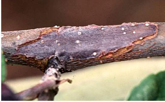
Fire blight canker.