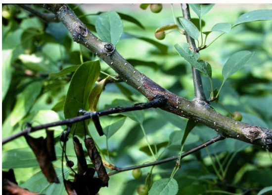
Fire blight canker and twig dieback on crabapple.

Conditions for Disease: The bacterium overwinters at the living margins of cankers, mostly on the branches and trunk or as symptomless infections in leaf and flower buds. In the spring, the bacterium oozes from infected cankers and is spread by splashing water, wind, contaminated pruning tools and insects (primarily bees) to nearby blossoms. The bacterium enters the plant through wounds or natural openings (such as stomata, hydathodes, lenticels, and nectaries). Infection commonly follows hail or other injuries. Environmental conditions favorable for fire blight are rainy or humid weather with