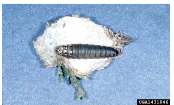
This bagworm caterpillar is exposed after its debris-covered, silk-lined bag was cut open. At most, only the head and thorax would be visible; the abdomen is totally covered by the bag.

Adult bagworms. The female adult (left) bagworm pupated but remains larviform in appearance. After mating and laying eggs inside her old bag, the female dies. The male (right) has bushy antennae and two pairs of wings sparsely covered with black scales that often wear off before the male dies.