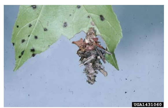
This bagworm is the same species as that feeding on conifer (above), but this one is feeding on a broadleaf host (sweet gum). Note the bits of foliage incorporated into the bag.