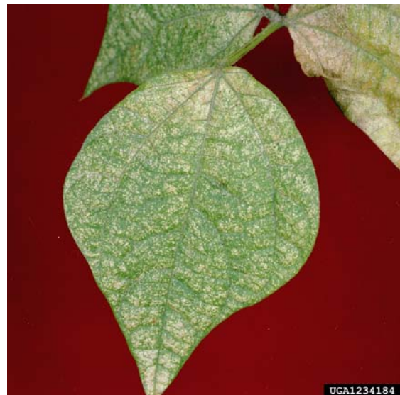
Spider mite damage on a broadleaf host plant. Note the dry and “sanded” appearance of the foliage, evidence of individual plant cell deaths caused by spider mite feeding.

Dormant oils are sometimes used on fruit trees or deciduous shade trees in the winter to control overwintering stages of pests such as spider mites. These oils coat the eggs or free-living stages of these pests, killing by contact or asphyxiation.