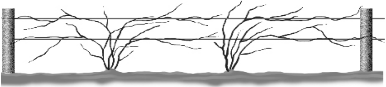
Figure 1. Fan type training system for blackberries.

of equipment, and personal preference. The best plant spacing within rows for trailing cultivars varies between 4 and 10 feet, depending on the vigor of the cultivar. Erect blackberry cultivars trained to a hedge should be planted 2–3 feet apart. Vigorous erect or semierect cultivars that are trained as individual plants to a trellis or stake should be planted 4–8 feet apart.