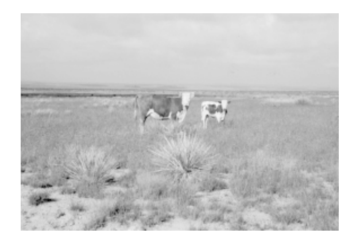
Figure 2. Research conducted at NMSU has demonstrated improved pregnancy rates among heifers fed protein supplements that contain 50 percent escape protein.

When performance is limited by energy intake and forage protein content is not limiting microbial activity,