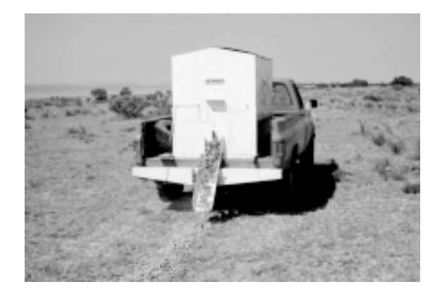
Figure 3. Protein supplements can be delivered as infrequently as once a week without significantly affecting animal performance. However, when providing energy supplements, best results are achieved when the supplement is delivered daily.