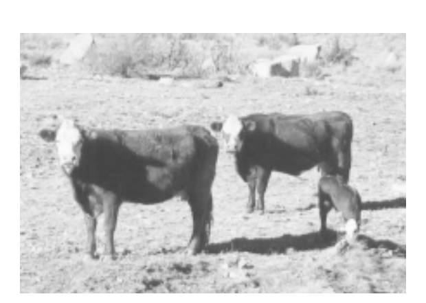
Figure 4. When forage supply is limited and stocking rate cannot be sufficiently reduced, it is best to use highly digestible sources of fiber to supplement energy.

the best option is to increase the energy intake directly with an energy supplement (low protein, high energy) if it is not possible to correct the short supply of energy by reducing stocking rates. Typically, energy supplements are less expensive per unit than protein supplements, but the response to energy supplementation can be variable and difficult to predict.