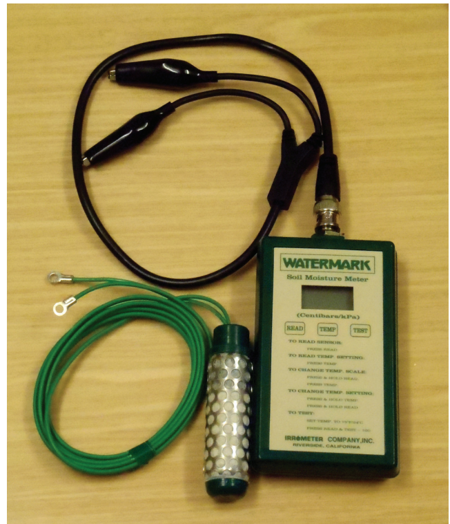
Figure 2. Granular matrix sensor and electric resistance meter.

Time domain reflectometry (TDR) relies on a known strong relationship between the volume of water held by a soil (not soil water tension as measured by tensiometers) and a readily measurable