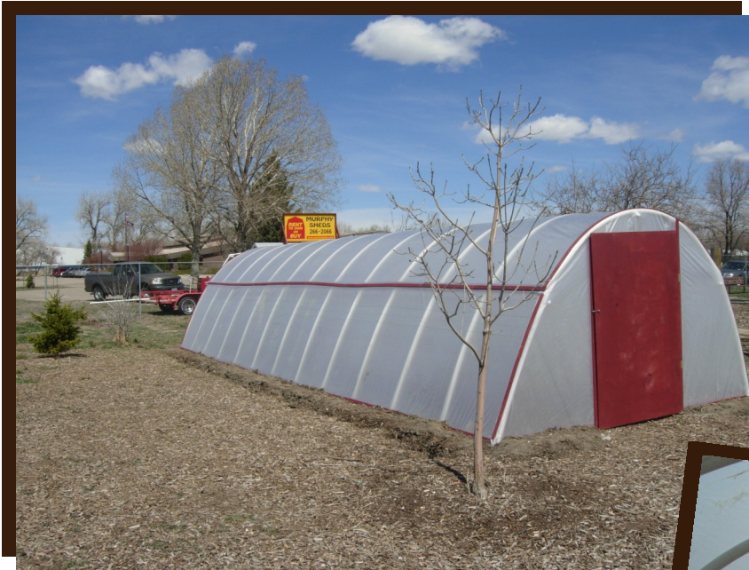
12ft x 36ft Hoop House 2