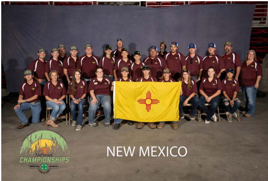
New Mexico 4-H - 2022 Shooting Sports National Championship competitors