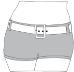
Shorts too short