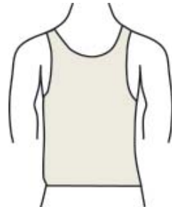
Muscle T-Shirt (Guys)