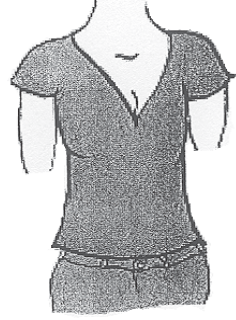
Low Cut Top