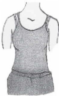
Visible Undergarments and Spaghetti Straps