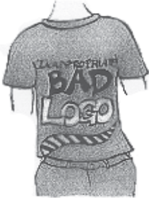
Offensive Slogans, Advertisements or Artwork on T-shirts and Hats