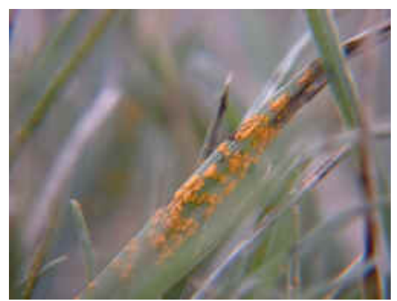
Rust on perennial ryegrass.