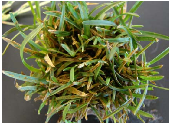
Leaf rust on Kentucky bluegrass.

Cool to warm (60-86°F), moist weather favors rust infections. Leaf wetness is required for infection. Condensed moisture, even dew, for 10 to 12 hours is sufficient for spores to infect plants. After infection, slightly warmer and drier conditions favor disease development and symptom expression. Rusts are often more severe in shaded areas than sunlit areas. Grass which is growing slowly under stressed conditions (nitrogen deficiency, low mowing height, compaction, drought and high temperature) is more susceptible to disease.