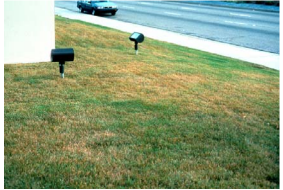
Stem rust on a Kentucky bluegrass lawn.

Management: Cultural practices which help to reduce the occurrence and severity of the disease include: