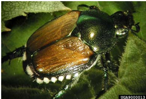
Adult Japanese beetle, Popilia japonica , an invasive species known from a very limited distribution in New Mexico. The adult is about as long as your little fingernail.

Masked chafers have annual life cycles, emerging as adults in late summer, hatching shortly thereafter and feeding heavily in early fall and spring. Their larvae also may dig deeper into the soil, becoming quiescent over the winter. Generally darker brown and very shiny, adults fly at night, are easily attracted to lights, but do not feed as adults.