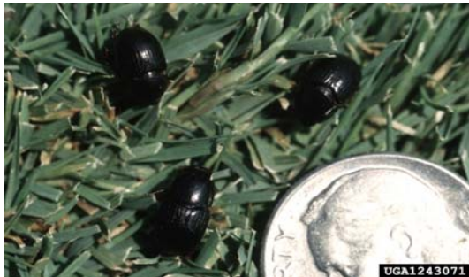
Adult Aphodius omisis omisis in Kentucky bluegrass (compare size to that of the dime).

Aphodius overwinters as adults but may have more than two generations annually in our lower elevations. Adults of many species are dung feeders; larvae feed on dung, organic matter and live roots. Attacking the same grasses as Ataenius , Aphodius also is found in warm season grasses grown at lower elevations, particularly those fertilized with manure or compost. Mature larvae are about the size of rice grains and are easily confused with Ataenius larvae ( Ataenius larvae have a pair of distinct pad-like structures on the tip of the abdomen just in front of the anal slit). Adults are dark brown to black and about 1/8 inch long. Aphodius adults have two “notches” in the tibia of the hind leg whereas Ataenius adults have none, features that require higher magnification. While over 100 species of Aphodius have been described from North America north of Mexico, the dominant pest species (in New Mexico and elsewhere) is A. granarius , accidentally introduced from Europe.