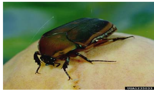
Adult of the eastern species of green June beetle, Cotinus nitida .

While Green June beetles are native insects, JBs obviously are not; JBs are currently established in small, isolated areas of north-central New Mexico where they are considered not only threats to turf and ornamentals but also regulatory pests requiring eradication efforts and close monitoring. JBs also have dull brassy wing covers with the rest of the body deep metallic green; however, JBs are only 3/8 inch long and have six pairs of white bristle patches around the edges of the wing covers. While Green June beetles are minor pests of turf, JBs can become primary turf pests as they have in other infested parts of the U.S. Adults of both