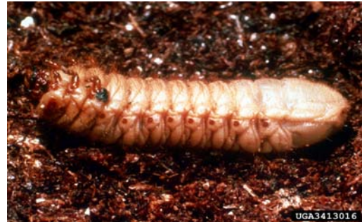
Larva of the green June beetle, Cotinus sp., a native to New Mexico.

Green June beetles are nearly one inch long with dull brassy wing covers; the rest of the body is metallic dark green.