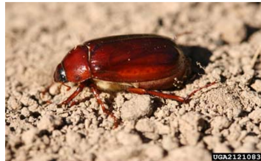
Example of a May or June beetle, Phyllophaga sp.

Newly hatched larvae feed voraciously on grass roots, often reaching third instar and nearly half of their mature weights before winter. In the fall, larvae of some species burrow several inches to a foot or more into the soil to hibernate; others may remain relatively close to the surface, feeding as temperatures permit. In early spring, all larvae return to the surface and resume feeding on grass roots. For species with annual life cycles, feeding is completed by spring. After pressing a small hollow into the soil, they pupate inside for about a month, resting briefly as young adults in their soil chambers before digging their way to the surface. Rainfall or irrigation stimulate adult emergence and