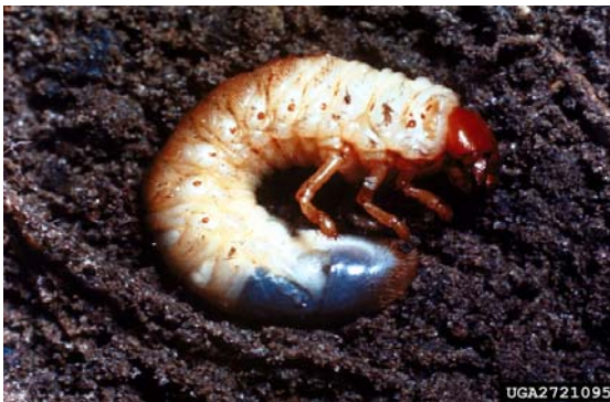
Example of a typical white grub or larva of a scarab beetle.

Probably the most common and most damaging pests of turfgrass in New Mexico are the white grubs, i.e., the larvae of scarab beetles. A number of scarab species are involved, varying widely in size, color and biological details. All turf species grown here, including the fine specialty turf on golf courses can be seriously damaged by these root-feeding larvae.