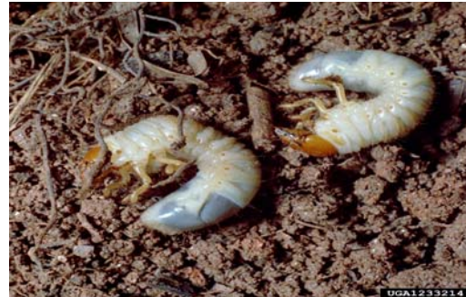
May or June beetle larvae, Phyllophaga sp.

eggs total in their adult lifetimes of about three weeks.