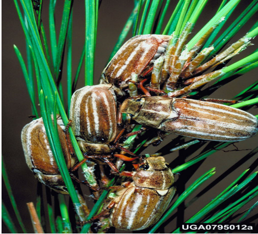
Adult lined June beetles, Polyphylla sp.

species will damage thin-skinned ripe fruit but JB's are also highly destructive to the flowers and foliage of over 300 species of landscape, garden and crop plants.