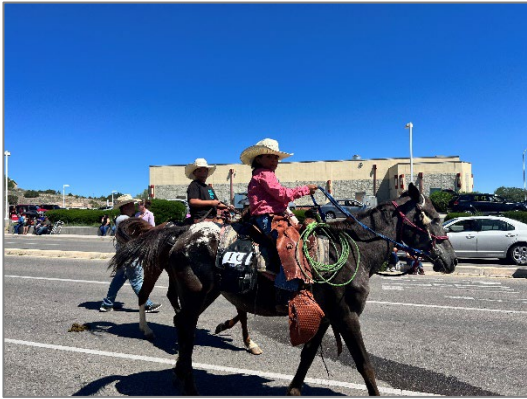
ESPANOLA FIESTAS: 4-H RIDING PROUD!

I pledge... My Head My Heart My Hands My Health To clearer thinking To greater loyalty To larger service To better living For my club, my community, my country and my world.