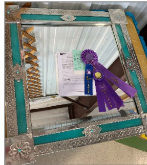
RIO ARRIBA COUNTY FAIR