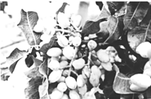
Fig. 9. Pistachio nuts before harvest.