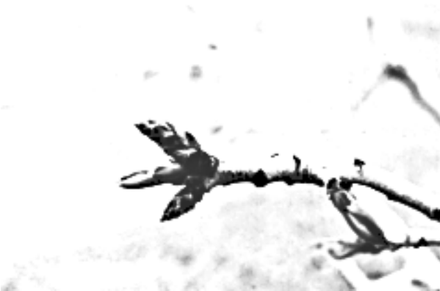
Fig. 7. Flower from 'Kerman' (female) variety.