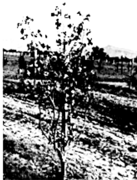
Fig. 4. Dead pistachio tree due to cotton root rot. (Dead leaves do not fall from the tree.)