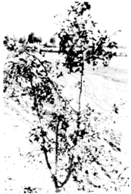
Figs. 1 and 2. Pistachio seedlings.