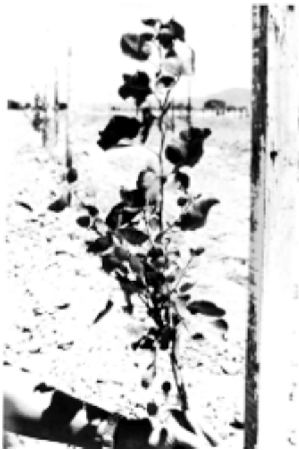
Fig. 3. Young 'Kerman' tree.