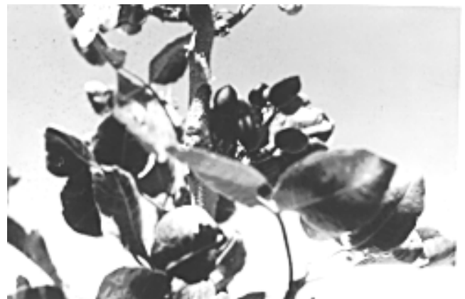
Fig. 8. Pistachio nuts during the season.