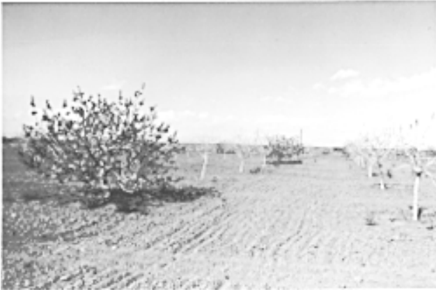
Fig. 5. Pistachio orchard, 'Peters' variety in the left row, 'Kerman' in the right row.