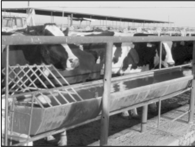
Figure 1. Cows may consume 30 to 50 percent of their daily water intake within 1 hour after milking.

pH is a measure of acidity or alkalinity. A pH of 7 is neutral, less than 7 is acidic and more than 7 is alkaline. Little is known about the specific pH's effect on water intake, animal health and production, or the microbial environment in the rumen. The preferred pH of drinking water for dairy animals is 6.0 to 8.0. Waters with a pH outside of the preferred range may cause nonspecific effects related to digestive upset, diarrhea, poor feed conversion and reduced water and feed intake.